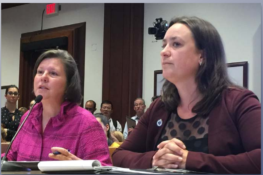
Senator Comerford and Representative Sabadosa deliver a resolution from the Northampton City Council

Municipal leadership plays a critical role in making state policy change happen. Greenfield City Council can join the cities of Northampton, Springfield and other Eastern MA communities to pass a Resolution urging the Legislature to adopt Right to Counsel and HOMES bills. It will make a meaningful difference!